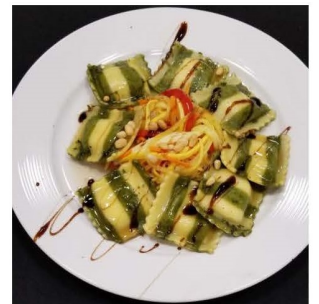
Vegetarian Striped Spinach Ricotta Ravioli