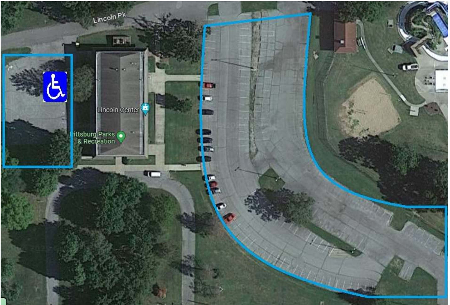
LINCOLN CENTER 710 W 9 TH ST PARKING AVAILABLE ON EAST SIDE. HANDICAP PARKING ON THE WEST SIDE.